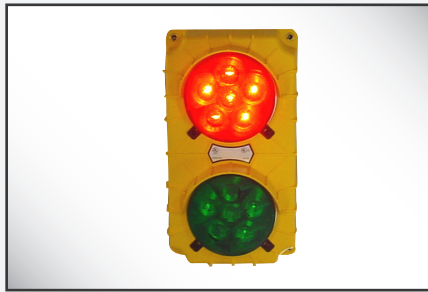
Exterior Lights - incandescent standard with optional LED for longer life.