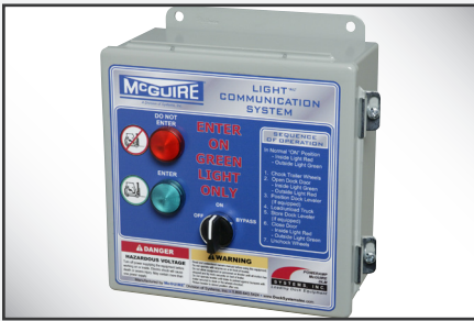
Light Communication System Control panel for automatic lights - manual light control panel similar.