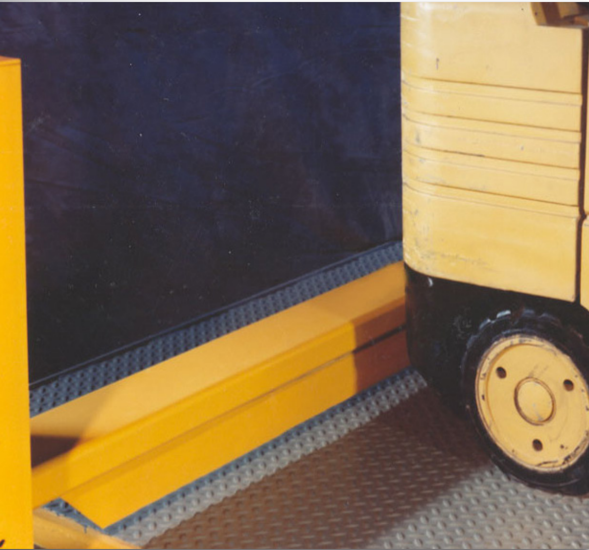
BarLift Barrier shown