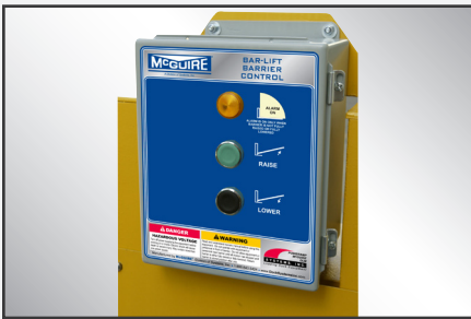
Interlock capable to door, leveler, restraint and other powered item at the dock.