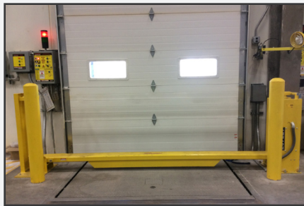
Collision protection for the overhead door.